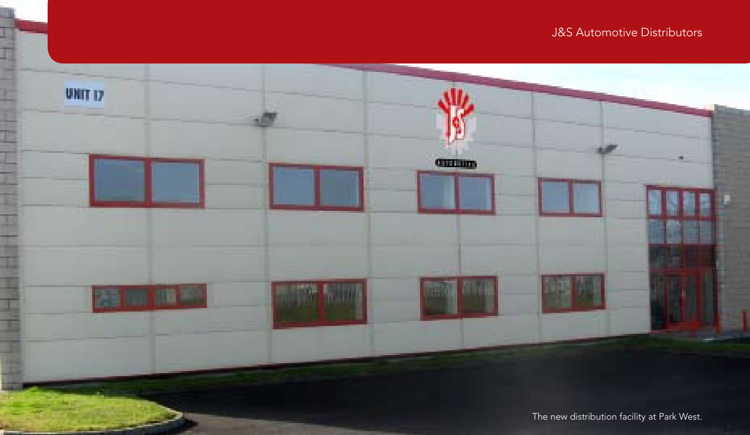
The new distribution facility at Park West.