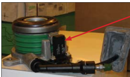
804549 – CSC for semi automatic gearbox