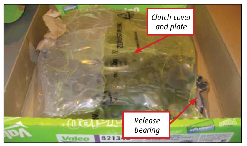
Release bearing sealed in box

Valeo will not accept a returned clutch with a damaged bearing if there are signs of fitment or the packaging has been opened.