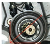
3 mounting points of CSC

During the installation of 826376 on the Land Rover Freelander TD4, particular attention should be made to the oil seal situated behind the CSC mounting guide tube. The CSC mounting points are the same for the guide tube. Valeo has found the seal may become damaged during removal of the CSC.