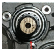
Rear seal condition OK