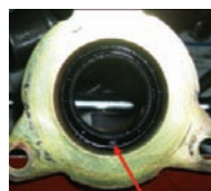
Guide tube seal found damaged