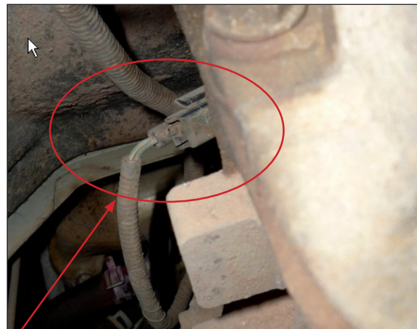
Location of the two sensor plugs on the MT75 gearbox