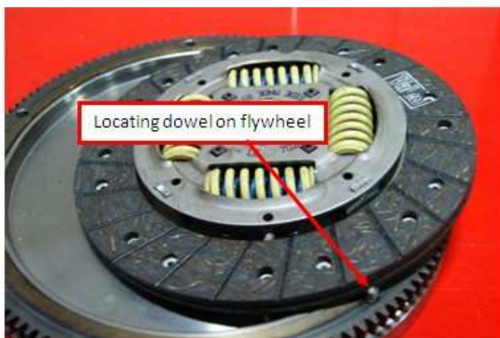
Image showing how clutch plate becomes damaged from locating dowels on flywheel